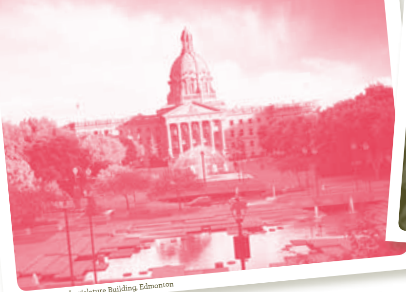
Alberta Legislature Building, Edmonton