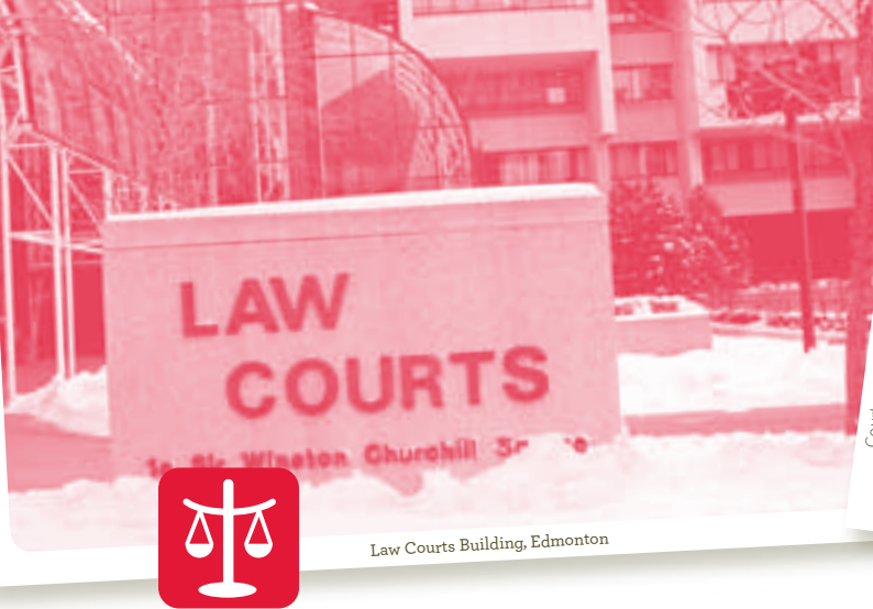
Law Courts Building, Edmonton