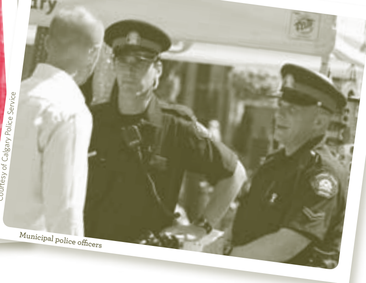
Municipal police officers